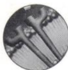
TYROSINE KINASE RECEPTORS