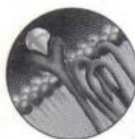
G PROTEIN-LINKED RECEPTORS

Call us for an evaluation of your cells and effector agents or for a detailed list of scientific references.