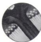
LIGAND-GATED ION CHANNELS